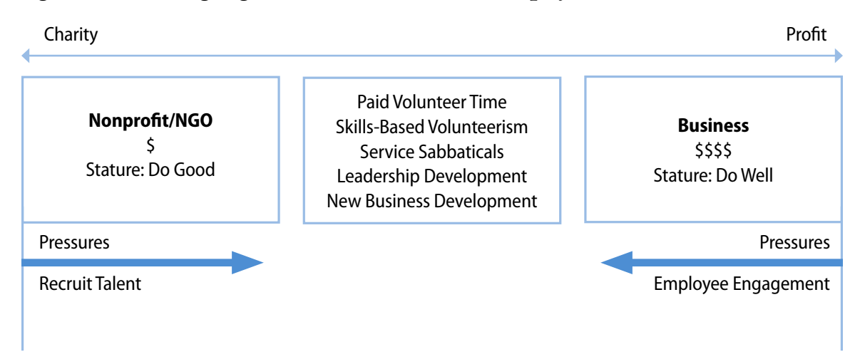
Figure 2: Rethinking Organizational Boundaries in Employee Terms